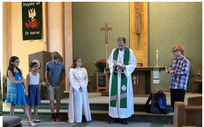
Blessing of the Backpacks