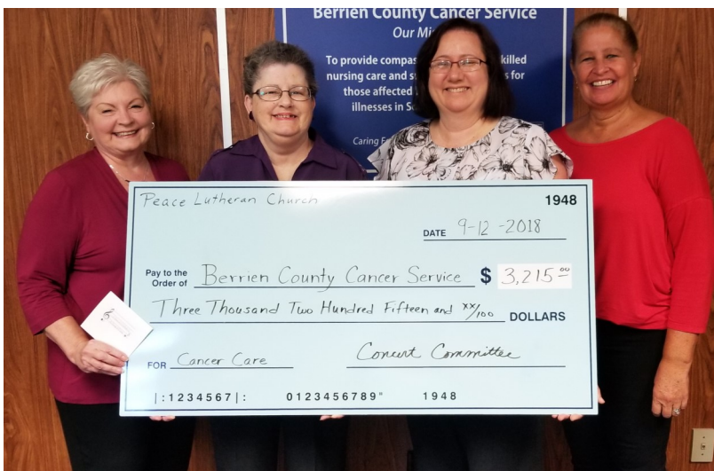
Berrien County Cancer Service donation