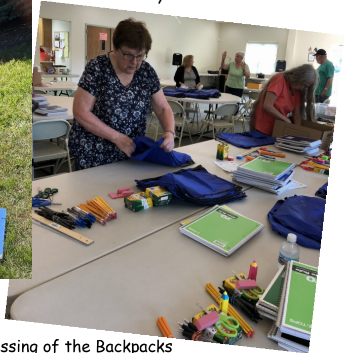
LWR Work Day