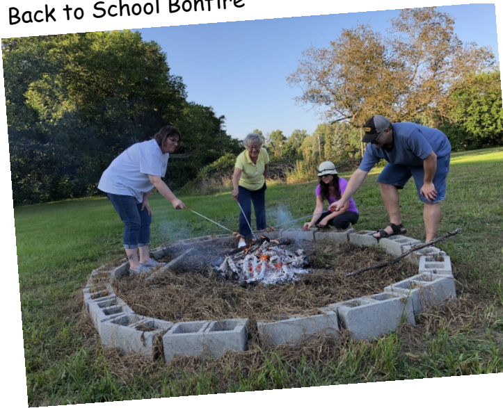
Back to School Bonfire