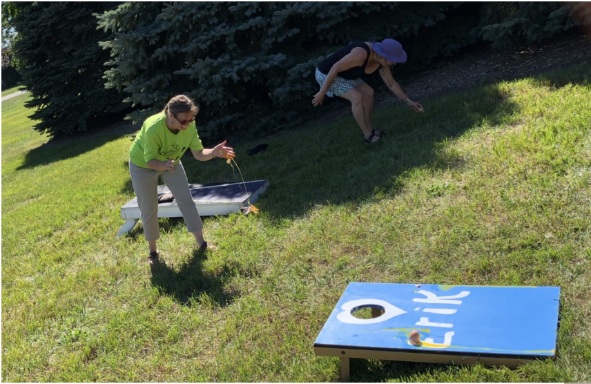
Egg Toss on Back to Church Sunday